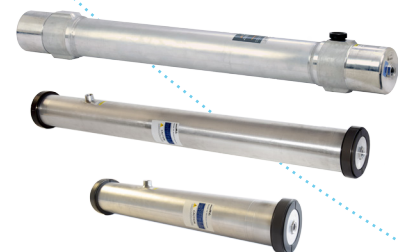
PRISM PB Membrane Separators